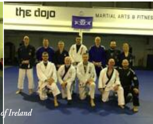
Brazilian Green of Ireland