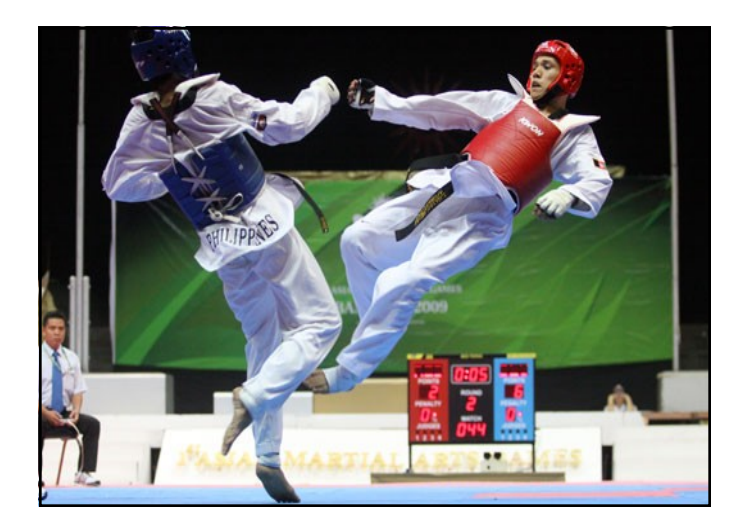
Excellence in Action!